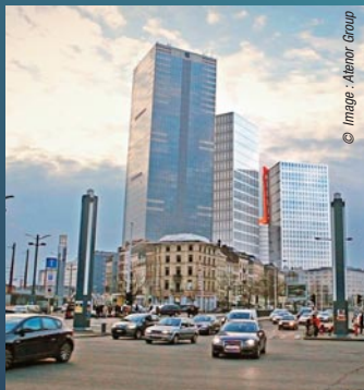
Victor Towers, Midi district, Brussels