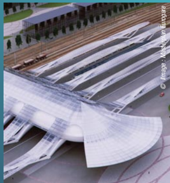
Mons station district